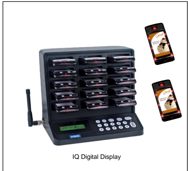
IQ Digital Display

HME Wireless, Inc Customer Service 800.919.9903 1400 Northbrook Parkway Suite #320 • Suwanee, GA 30024