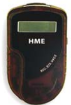
Rechargeable Numeric Pager