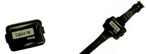
Belt Holster Pager