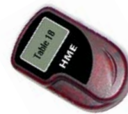
Alpha Numeric Pager