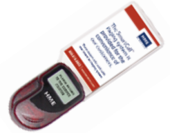
SmartCall Alpha Numeric Paddle Pager

Alphanumeric four line text messaging coaster style pager.