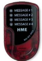
4 Lite Message Pager

Alphanumeric, four line text messaging pager. Clips on belt. Also available with a paddle.