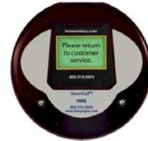
SmartCall Alpha Numeric Coaster Pager

Alphanumeric four line text messaging coaster style pager.