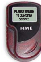
SmartCall Alpha Numeric Belt Clip Pager

Alphanumeric four line text messaging paddle style pager.